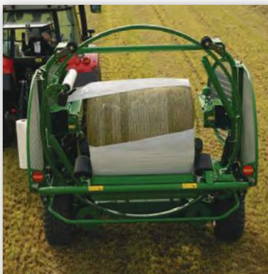
VERTICAL WRAPPING RING