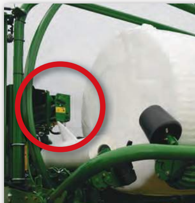
RELIABLE CUT AND HOLDS