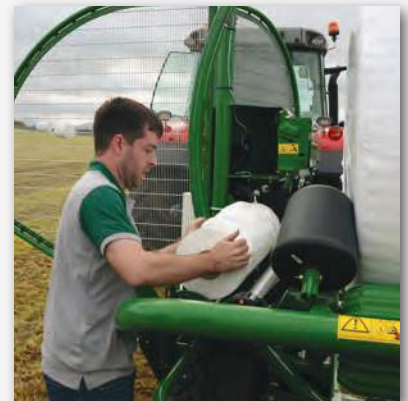
EASY FILM LOADING